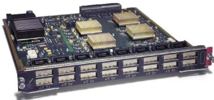
Figure 7. Classic Gigabit Ethernet Optical Interface Module WS-X6416-GBIC

* Queues Legend: 1p3q1t = 1 priority queue, 3 round robin queues, 1 threshold