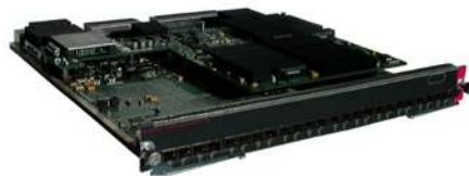
24 Port SFP-Based Module