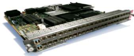
48 Port SFP-Based Module