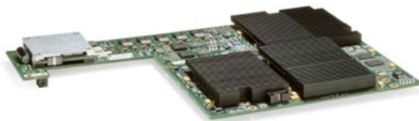
Figure 4. The Optional Field-Upgradeable for use with CEF720 Class Interface Modules