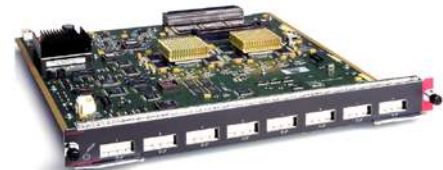
8 Port GBIC-Based Module

Designed to complement the many roles that the Cisco Catalyst 6500 Series plays in a network, Cisco Catalyst 6500 Series mixed media Gigabit Ethernet modules offer the broadest selection of media, densities, performance, interoperability, and chassis deployments for enterprises and service providers. These modules are ideal for gigabit Ethernet over fiber to the desktop, gigabit uplinks, aggregation of high-density 10/100 interfaces, Metro Ethernet, backbone and high-speed server farm or data center connections as well as mixed media environments supporting both fiber and copper cable connections. The Cisco Catalyst 6500 Series Gigabit Ethernet modules offer: