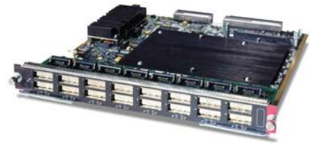
16 Port GBIC-Based Module