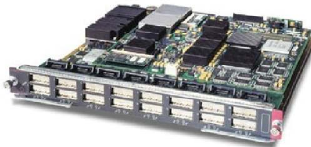
Figure 5. dCEF256 Gigabit Ethernet Optical Interface Modules WS-X6816-GBIC

* Queues Legend: 1p3q1t = 1 priority queue, 3 round robin queues, 1 threshold