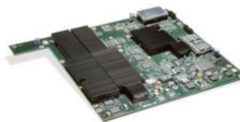
Optional field-upgradeable Distributed Forwarding Card (DFC)