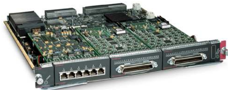
Figure 1. Cisco Communication Media Module

The Cisco CMM is a modular line card that supports four different types of port adapters, including 6-port T1, 6-port E1, 24-port foreign exchange station (FXS), and 128-port conferencing and transcoding port adapters. Up to four port adapters can be installed in a single Cisco CMM Line Card. Customers have the flexibility of mixing any of the four types of port adapters in a single Cisco CMM (Note: Mixed E1 and T1 port adapters on the same CMM are not allowed).