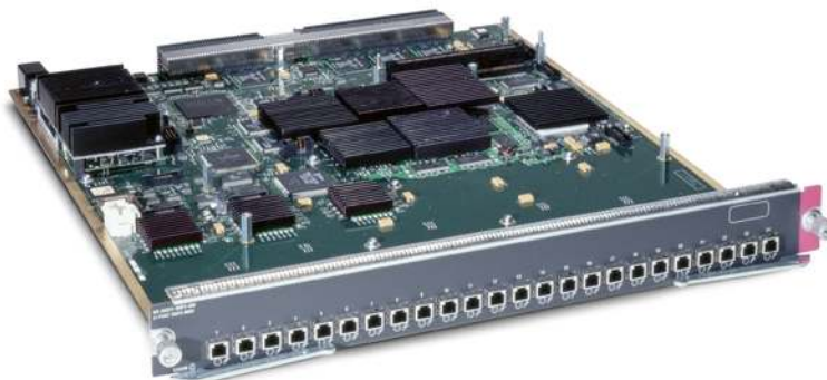
Figure 3. CEF256-Based 100BASE-FX Fiber Interface Module (part number WS-X6524-100FX-MM)