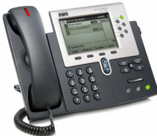
Figure 1. Cisco Unified IP Phone 7961G

The Cisco Unified IP Phone 7961G, an important addition to the Cisco Systems® award-winning IP phone portfolio, is a full-featured, enhanced manager IP phone. It is designed to meet the needs of managers and administrative assistants (Figure 1). It provides six programmable backlit line/feature buttons and four interactive soft keys that guide a user through call features and functions, and audio controls for high-quality duplex speakerphone, handset, and headset. A built-in headset port and an integrated Ethernet switch are standard with the Cisco Unified IP Phone 7961G. The phone also features a best-of-class large, higher-resolution grayscale pixel-based LCD (Figure 2). The display provides features such as date and time, calling party name, calling party number, and digits dialed. The crisp graphic capability of the display allows for the inclusion of higher value, more visibly rich Extensible Markup Language (XML) applications and double-byte languages.