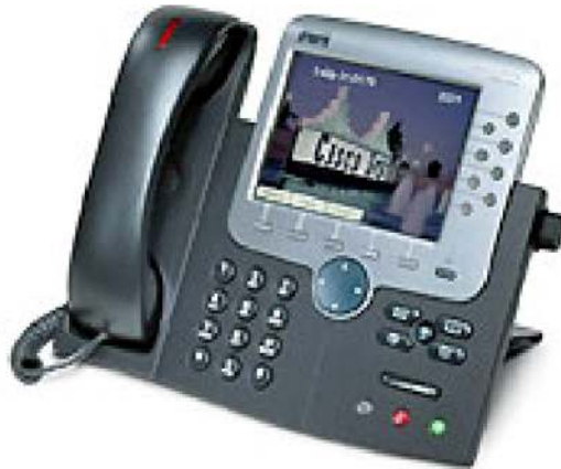
Figure 1. Cisco Unified IP Phone 7971G-GE

The Cisco Unified Communications system of voice and IP Communications products and applications helps organizations communicate more effectively—by helping them streamline business processes, reach the right resource the first time, and enhance productivity. The Cisco Unified Communications portfolio is an integral part of the Cisco Business Communications Solution—an integrated solution for organizations of all sizes that also includes network infrastructure, security, and network management products; wireless connectivity; and a lifecycle services approach, along with flexible deployment and outsourced management options, end-user and partner financing packages, and third-party communications applications.