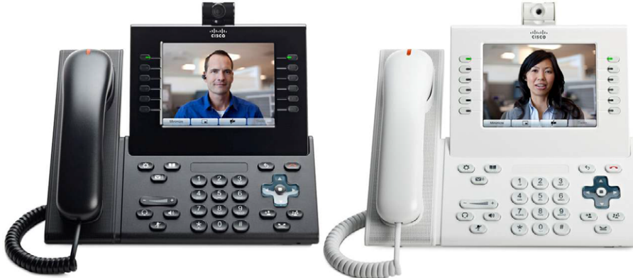
Figure 1. Cisco Unified IP Phone 9971