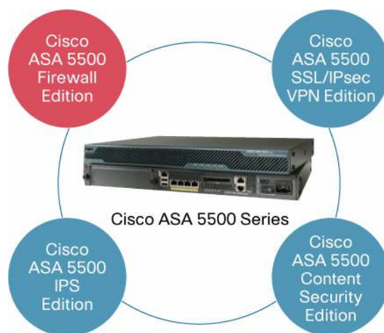
Figure 2. Complementary Solutions