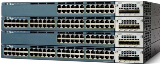
Figure 2. Cisco Catalyst 3560-X Series Switches

Figure 2 shows Cisco Catalyst 3560-X Series Switches.