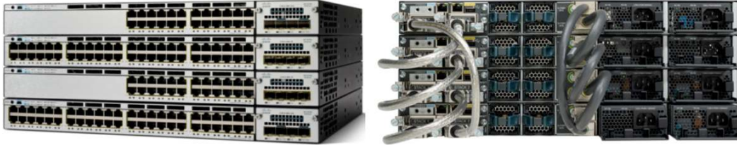
Figure 1. Cisco Catalyst 3750-X Series Switches (Front and Back)

Table 1 shows the Cisco Catalyst 3750-X Series configurations.