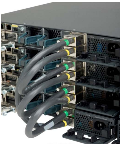
Figure 3. StackPower Connector

StackPower can be deployed in either power sharing mode or redundancy mode. In power sharing mode, the power of all the power supplies in the stack is aggregated and distributed among the switches in the stack. In redundant mode, when the total power budget of the stack is calculated, the wattage of the largest power supply is not included. That power is held in reserve and used to maintain power to switches and attached devices when one