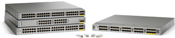
Figure 1. Cisco Nexus 2148T, 2248TP, 2224TP, and 2232PP Fabric Extenders

The Cisco Nexus 2000 Series connects to a parent Cisco Nexus switch through fabric links using CX1 copper cable, short-reach or long-reach optics, and the cost-effective Cisco Fabric Extender Transceivers (FET). The complete range of Cisco Nexus 2000 Series products can connect to parent Cisco Nexus 5000 Series Switches to support large-scale Gigabit Ethernet and 10 Gigabit Ethernet environments over a unified lossless fabric.