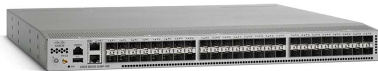
Figure 1. Cisco Nexus 3548 Switch

The Cisco Nexus 3548 has the following hardware configuration: