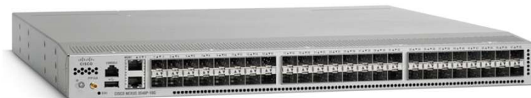
Figure 4. Cisco Nexus 3524 Switch

The Cisco Nexus 3524 has the following hardware configuration: