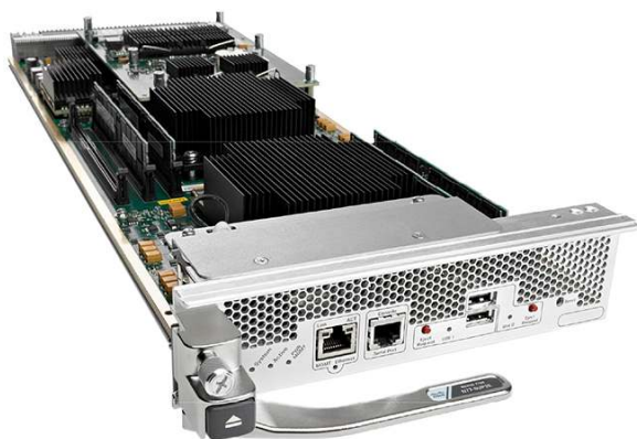
Figure 1. Cisco Nexus 7700 Supervisor 2E Module

The fully distributed forwarding architecture allows the supervisor to support transparent upgrades to I/O and fabric modules with greater forwarding capacity. Two supervisors are required for a fully redundant system, with one supervisor module running as the active device and the other in hot-standby mode, providing exceptional high-availability features such as stateful switchover and In-Service Software Upgrade (ISSU) on mission-critical data center-class products.