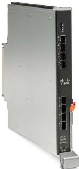
Table 1 lists the Cisco Nexus B22 Blade Fabric Extenders. Cisco Nexus B22 Blade Fabric Extenders and Cisco Nexus 2000 Series Fabric Extenders can be mixed and matched to a parent switch to provide a variety of connectivity options, as shown in Table 2.