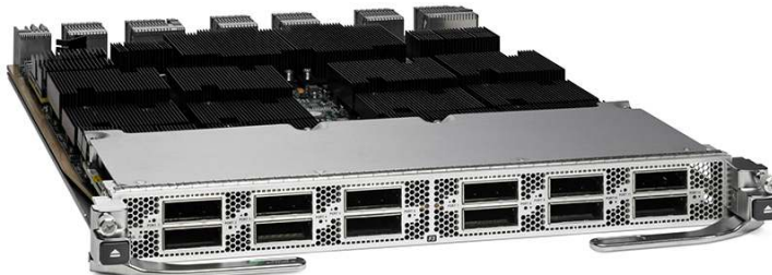
Table 1. Cisco Nexus 7700 Platform 100 Gigabit Ethernet Maximum Port Density