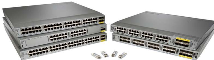
Figure 2. Cisco Nexus 2000 Series Fabric Extenders

The Cisco Nexus 2000 Series Fabric Extenders comprise a category of data center products that provide a server-access platform that scales across a multitude of 1 Gigabit Ethernet, 10 Gigabit Ethernet, unified fabric, rack, and blade server environments. The Cisco Nexus 2000 Series Fabric Extenders are designed to simplify data center architecture and operations by dramatically reducing the points of management and by meeting the business and application needs of a data center. Working in conjunction with Cisco Nexus switches, the Cisco Nexus 2000 Series Fabric Extenders offer a cost-effective and efficient way to support today's Gigabit Ethernet environments while allowing easy migration to 10 Gigabit Ethernet, virtual machine-aware Cisco unified fabric technologies.