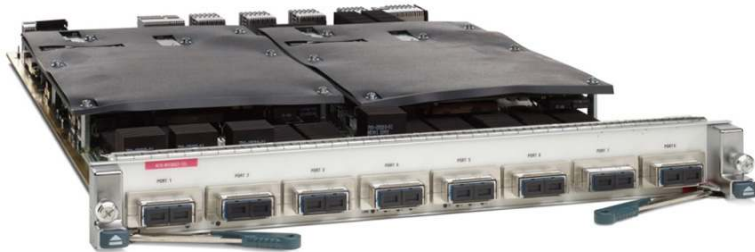
Figure 1. Cisco Nexus 7000 M1-Series 8-Port 10 Gigabit Ethernet Module with XL Option

The Cisco Nexus 7000 Series Switches are a modular data center-class product line designed for highly scalable 10 Gigabit Ethernet networks, with a fabric architecture that scales beyond 15 terabits per second (Tbps), and is designed to support high-density 40 and 100 Gigabit Ethernet deployments. Designed to meet the requirements of the most mission-critical network environments, the switches deliver continuous system operation and virtualized pervasive services. The Cisco Nexus 7000 Series is powered by the proven Cisco ® NX-OS operating system, with enhanced features to deliver real-time system upgrades with exceptional manageability and serviceability. Its innovative unified fabric design is purpose-built to support consolidation of IP, storage, and interprocess communication (IPC) networks on a single Ethernet fabric.