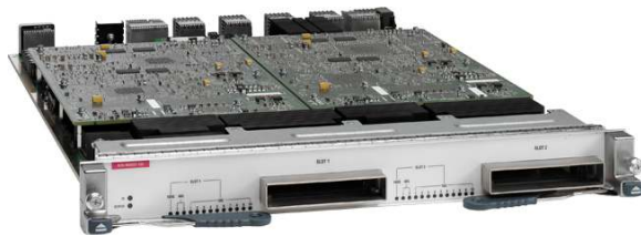
Figure 1. Cisco Nexus 7000 M2-Series 2-Port 100 Gigabit Ethernet Module with XL Option

The Cisco Nexus 7000 Series Switches provide the foundation of the Cisco ® Unified Fabric. They are a modular data center-class product line designed for highly scalable 10 Gigabit Ethernet networks. The fabric architecture scales beyond 15 terabits per second (Tbps), and is designed to support high-density 40 and 100 Gigabit Ethernet deployments. To meet the requirements of the most mission-critical network environments, the switches deliver continuous system operations and virtualized services. The Cisco Nexus 7000 Series is powered by the proven Cisco NX-OS Software operating system, with enhanced features to deliver real-time system upgrades with exceptional manageability and serviceability. The software's innovative unified fabric design is purpose-built to support consolidation of IP and storage networks on a single lossless Ethernet fabric.