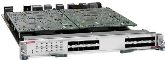
Figure 1. Cisco Nexus 7000 M2-Series 24-Port 10 Gigabit Ethernet Module with XL Option

The Cisco Nexus 7000 Series Switches provide the foundation of the Cisco ® Unified Fabric. They are a modular data center-class product line designed for highly scalable 10 Gigabit Ethernet networks. The fabric architecture scales beyond 15 terabits per second (Tbps), and is designed to support high-density 40 and 100 Gigabit Ethernet deployments. To meet the requirements of the most mission-critical network environments, the switches deliver continuous system operations and virtualized services. The Cisco Nexus 7000 Series is powered by the proven Cisco NX-OS Software operating system, with enhanced features to deliver real-time system upgrades with exceptional manageability and serviceability. The software's innovative unified fabric design is purpose-built to support consolidation of IP and storage networks on a single lossless Ethernet fabric.