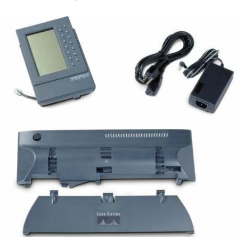
Figure 3. Required Items for a Double Cisco Unified IP Phone Expansion Modules 7914 Installation