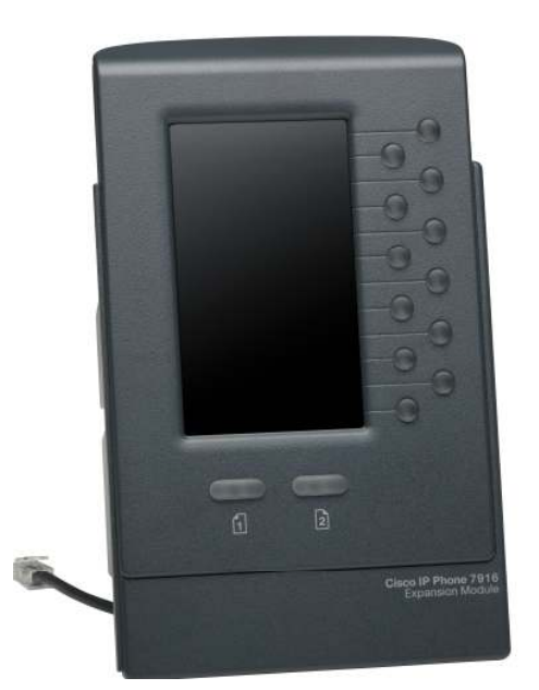
Figure 1. Cisco Unified IP Phone Expansion Module 7916

The power of the Cisco Unified Communications family of products extends throughout the enterprise by delivering powerful, converged voice solutions with the new Cisco Unified IP Phone Expansion Module 7916 extending capabilities to wideband audio phones (Figure 1).