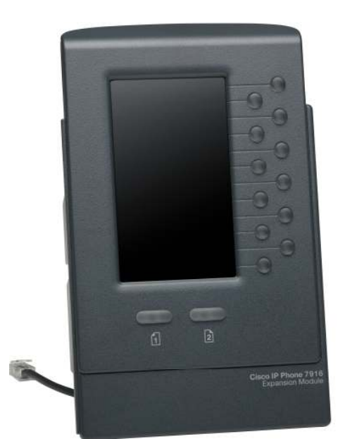
Figure 1. Cisco Unified IP Phone Expansion Module 7916

The power of the Cisco Unified Communications family of products extends throughout the enterprise by delivering powerful, converged voice solutions with the new Cisco Unified IP Phone Expansion Module 7916 extending capabilities to wideband audio phones (Figure 1).