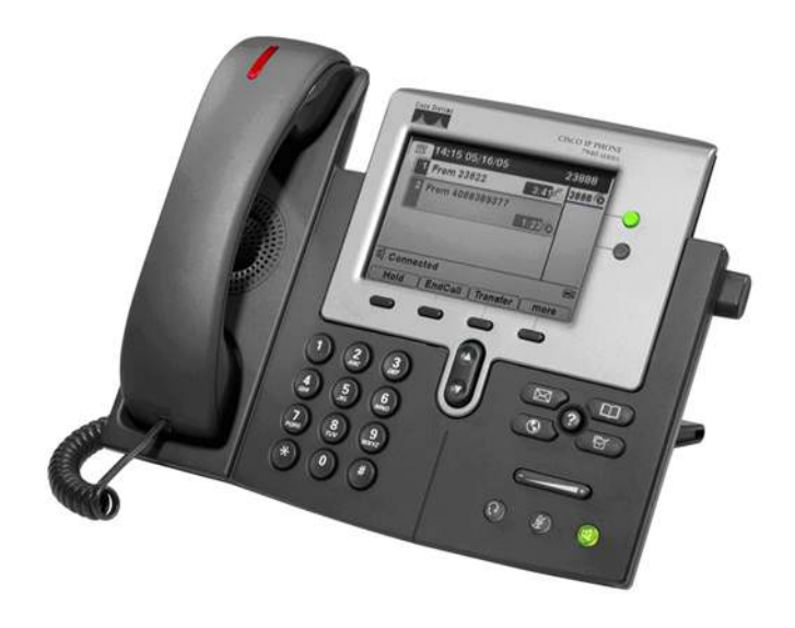
Figure 1. Cisco Unified IP Phone 7941G

The Cisco Unified IP Phone 7941G is a full-featured enhanced business IP phone that addresses the communication needs of the transaction worker (Figure 1). It provides two programmable backlit line/feature buttons and four interactive soft keys that guide a user through call features and functions, and audio controls for high-quality duplex speakerphone, handset, and headset. A built-in headset port and an integrated Ethernet switch are standard with the Cisco Unified IP Phone 7941G. The phone also features a best-of-class large, higher-resolution grayscale pixel-based LCD (Figure 2). The display provides features such as date and time, calling party name, calling party number, and digits dialed. The graphic capability of the display allows for the inclusion of higher value, more visibly rich Extensible Markup Language (XML) applications and double-byte languages.