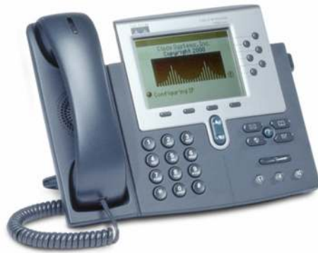
Figure 1. Cisco Unified IP Phone 7960G

The Cisco Unified IP Phone 7960G, a key offering in the IP Phone portfolio, is a full-featured IP phone primarily for manager and executive needs. It provides six programmable line/feature buttons and four interactive soft keys that guide a user through call features and functions. Audio controls for duplex speakerphone, handset and headset. The Cisco Unified IP Phone 7960G also features a large, pixel-based LCD display. The display provides features such as date and time, calling party name, calling party number, and digits dialed. The graphic capability of the display allows for the inclusion of such features as XML (Extensible Markup Language) and future features.