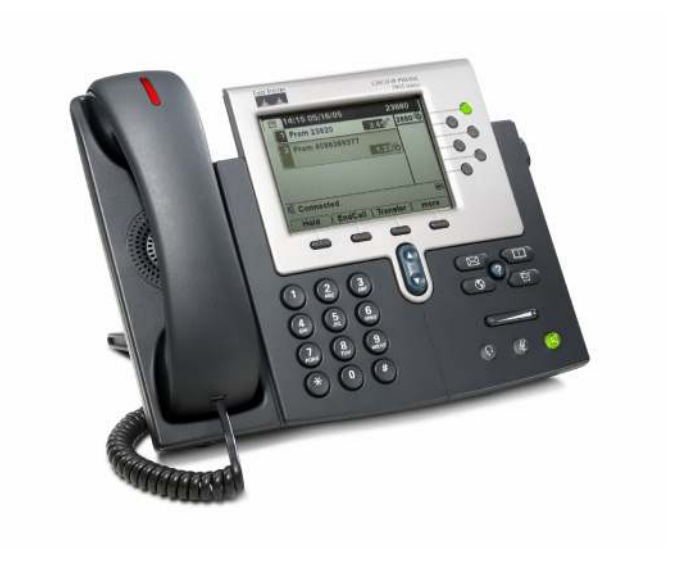
Figure 1. Cisco Unified IP Phone 7961G

The Cisco Unified IP Phone 7961G, an important addition to the Cisco Systems® award-winning IP phone portfolio, is a full-featured, enhanced manager IP phone. It is designed to meet the needs of managers and administrative assistants (Figure 1). It provides six programmable backlit line/feature buttons and four interactive soft keys that guide a user through call features and functions, and audio controls for high-quality duplex speakerphone, handset, and headset. A built-in headset port and an integrated Ethernet switch are standard with the Cisco Unified IP Phone 7961G. The phone also features a best-of-class large, higher-resolution grayscale pixel-based LCD (Figure 2). The display provides features such as date and time, calling party name, calling party number, and digits dialed. The crisp graphic capability of the display allows for the inclusion of higher value, more visibly rich Extensible Markup Language (XML) applications and double-byte languages.