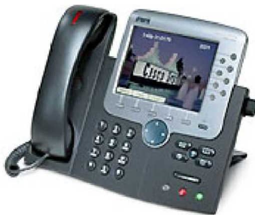
Figure 1. Cisco Unified IP Phone 7971G-GE

The Cisco Unified Communications system of voice and IP Communications products and applications helps organizations communicate more effectively—by helping them streamline business processes, reach the right resource the first time, and enhance productivity. The Cisco Unified Communications portfolio is an integral part of the Cisco Business Communications Solution—an integrated solution for organizations of all sizes that also includes network infrastructure, security, and network management products; wireless connectivity; and a lifecycle services approach, along with flexible deployment and outsourced management options, end-user and partner financing packages, and third-party communications applications.